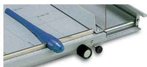
GEAR DRIVEN FRONT PAPER BAR For perfect paper alignment and cutting accuracy