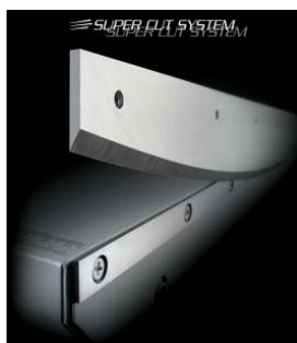
SUPER CUT SYSTEM Carbon hardened steel blades and counter-blades with 65° sharpening for long-lasting cutting operations