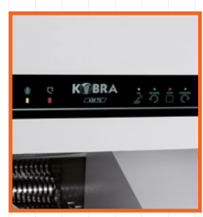
TOUCH SCREEN PANEL