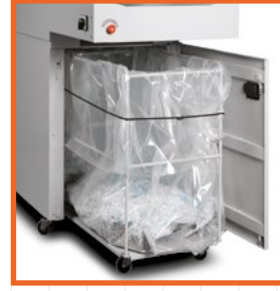
ADJUSTABLE REMOVABLE TROLLEY accomodating one bag of 470 litres or two bags of 235 litres.