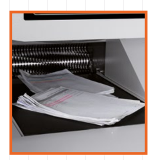
ELECTRIC CONVEYOR BELT convenient conveyor belt for easy feeding of material to shred.