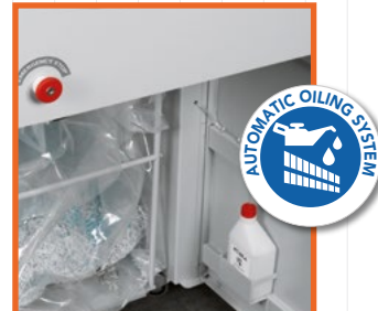
INTEGRATED AUTOMATIC OILER: it eliminates the need to manually lubricate the unit, ensuring maximum reliability, efficiency and capacity.